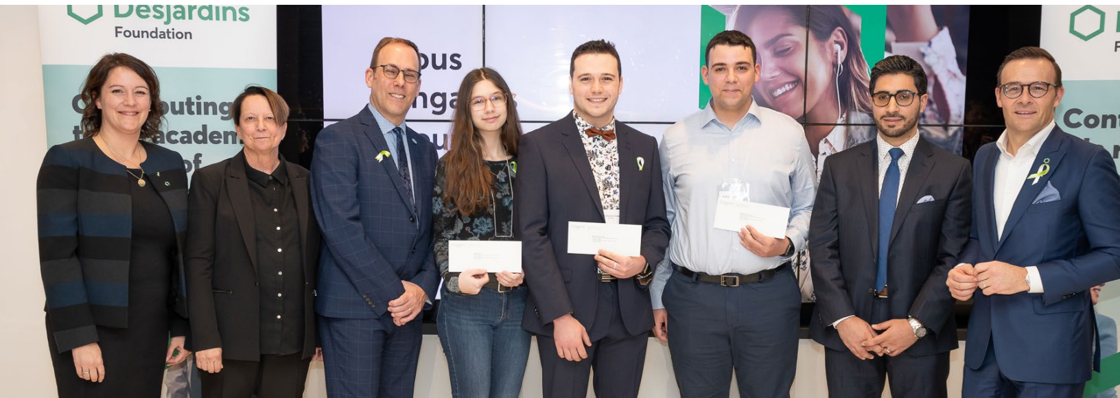
Scholarship presentation on February 17, 2020