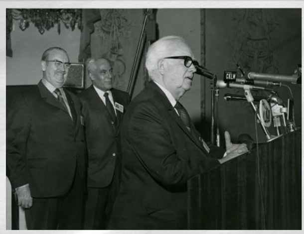
Émile Girardin, at the Foundation's launch in 1970