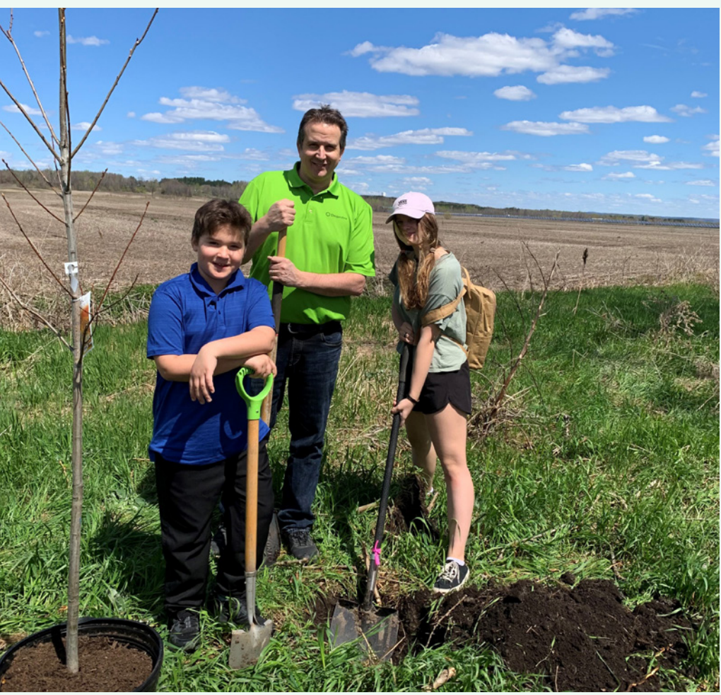
Prescott and Russell Recreational Trail tree planting

Desjardins Ontario Credit Union contributed to a number of initiatives to protect our planet and encourage people to do their part for the environment. Our staff and administrative team took part in initiatives to clean up garbage and plant trees.