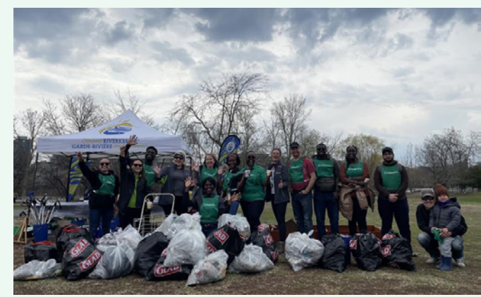
Ottawa Riverkeeper shoreline cleanup

Desjardins Ontario Credit Union contributed to a number of initiatives to protect our planet and encourage people to do their part for the environment. Our staff and administrative team took part in initiatives to clean up garbage and plant trees.