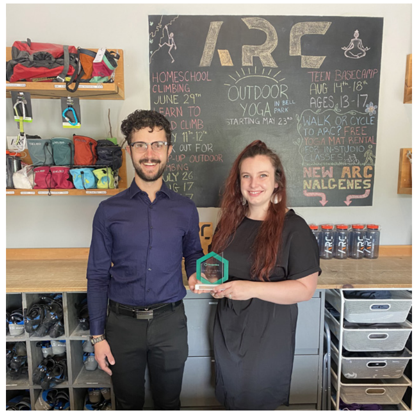
Arc Climbing is an indoor climbing gym and yoga studio in Sudbury. The funds provided by the Momentum Fund enabled the purchase of new equipment and the redesign of the facility's layout.