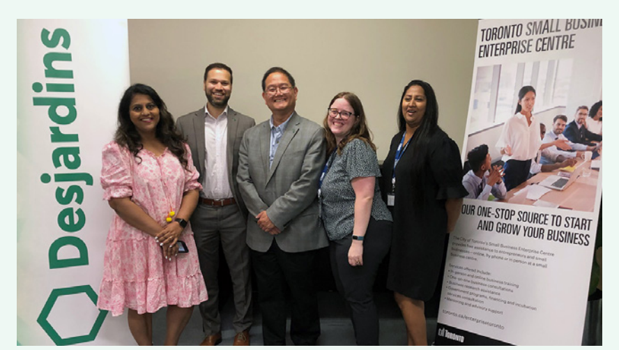
Thanks to a partnership between the City of Toronto and Desjardins Ontario Credit Union, our Desjardins Business professionals are on hand to meet with entrepreneurs at 2 Toronto Small Business Enterprise Centre locations in North York and Scarborough to discuss their business needs and opportunities and help them make solid plans.