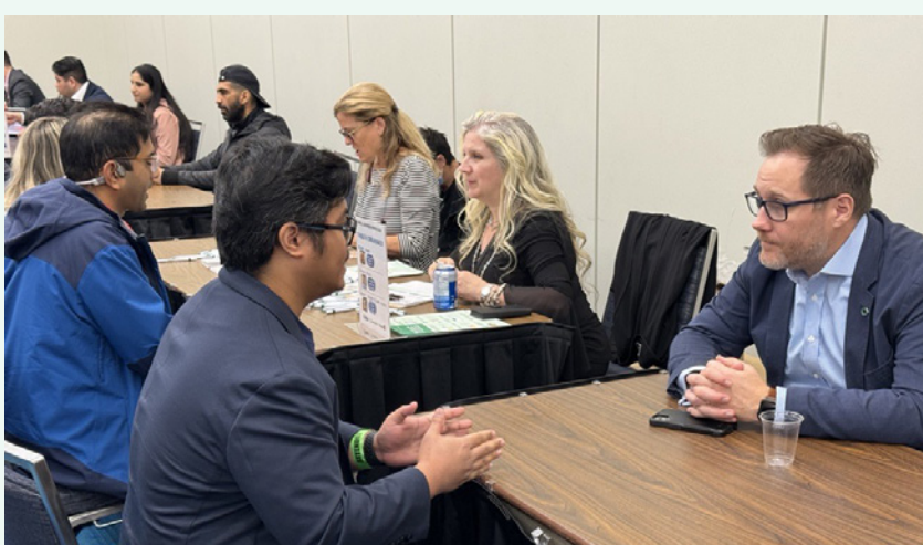
The City of Toronto's Small Business Forum provides an opportunity for future business owners to meet with the Desjardins team to talk about their vision and map out their business plan.