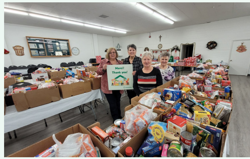
Fédération nationale des femmes canadiennes françaises donated food baskets for the holiday season