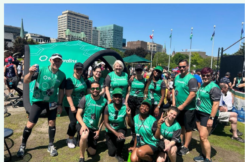
Run Ottawa organizes running events that attract runners from all over and help raise funds for many community organizations.

Desjardins Ontario Credit Union is a partner of many community running events. Sponsorships such as these enable us to support various fundraising campaigns for charitable organizations while promoting health and physical activity.