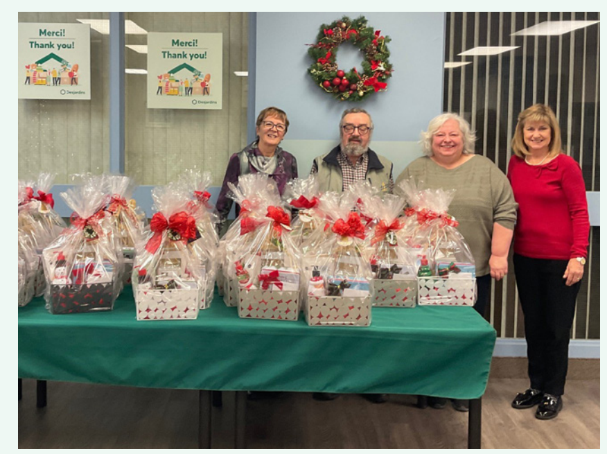
Rendez-vous des aînés francophones d'Ottawa (RAFO) donating gifts baskets.

$100,000 to organizations in Ontario to help those in need through the holidays and spread a little happiness. Thanks to the Help our Neighbours Campaign, several food banks, snowsuit for kids programs, and associations providing services to people in need received additional financial support.