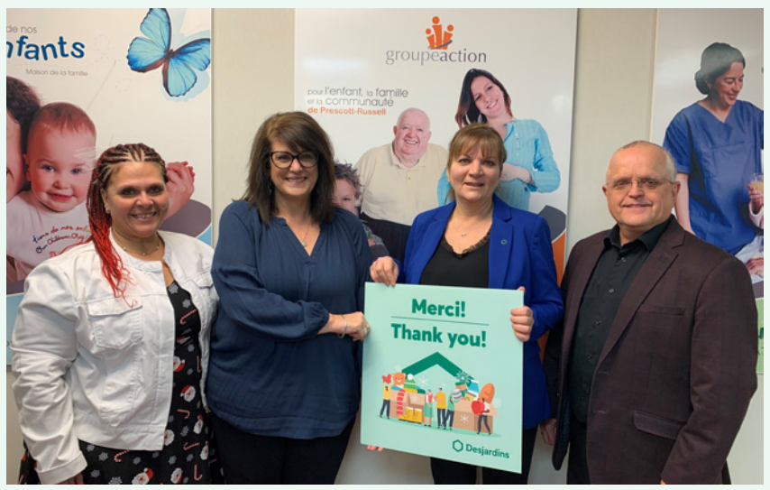
Groupe Action and Maison de la famille de Hawkesbury are purchasing snowsuits to gift to local children.