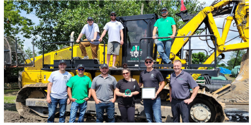
Sauvé drainage agricole inc. is a young drainage company operating in eastern and northern Ontario. The financial support from the Momentum Fund has enabled the company to acquire a GPS system and an equipment control system.

Desiardins Ontario Credit Union distributed $170,000 of funding to 19 business projects in Ontario through the Momentum Fund . Selected projects can receive up to $20,000 in support. We support projects in the categories of innovation, business transfers, exports, business succession, energy efficiency initiatives, ergonomic and public health measures, digital transformation, psychological support, and business model change.