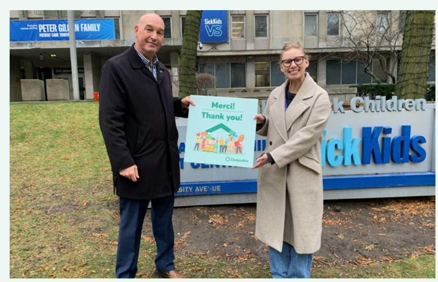
Helping children during the holiday season through a donation to the SickKids Foundation.