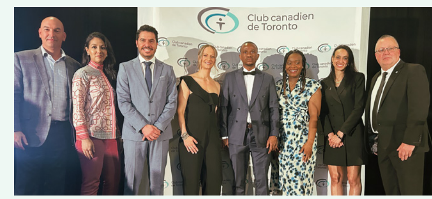
Our managers were at the event organized by Club Canadien de Toronto to congratulate the young winners of the Prix RelèveON.