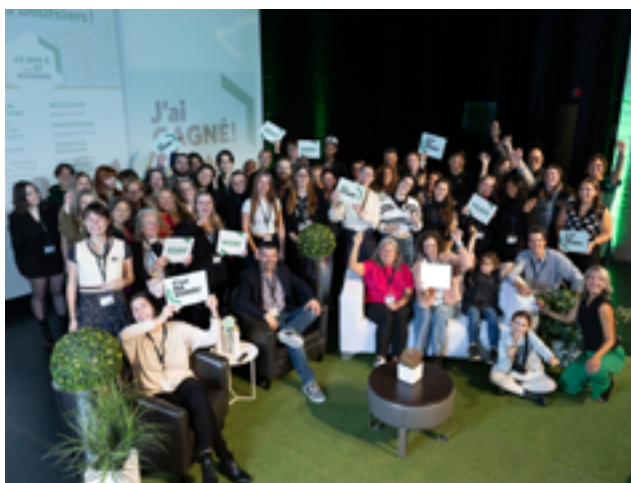
Scholarship winners and their guests during the gala event hosted by Caisse Desjardins de D'Autray.

All of Desjardins Group is engaged in helping kids succeed in school. Here are some initiatives carried out by our caisses to help local schools and showcase our scholarship winners' hard work and success.