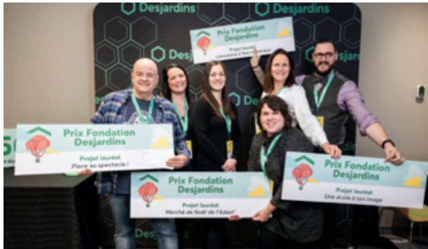
Winners during the event hosted by Caisse Desjardins des Moissons-et-de-Roussillon

The Châteauguay, La Prairie, Ouest de la Montérégie, Moissons-et-de-Roussillon and Seigneuries de la frontière caisses have launched a substantial investment program for local schools, which allows them to support projects submitted for the Desjardins Foundation Prizes. This year, the five caisses handed out nearly $84,000 to support an additional 32 initiatives in the region.