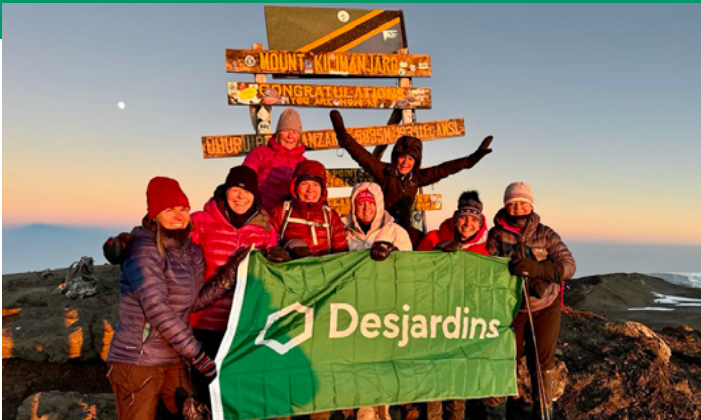
The 8 women atop Mount Kilimanjaro.