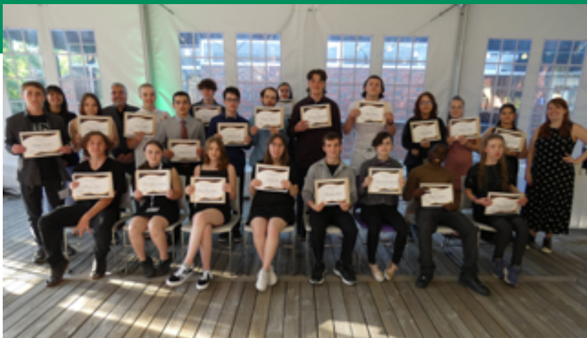
A group of young people at the CFER scholarship ceremony.