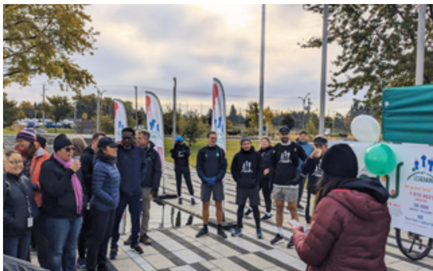
Participants at the starting line for the On the Road event in Lévis.

People who push their limits in support of a worthy cause deserve to be celebrated for their dedication. The Desjardins Foundation is fortunate to have enthusiastic supporters who raise sizeable funds to help young people reach their full potential. Here are two remarkable fundraisers that have received lots of support and are an inspiration for anyone thinking about raising money for a worthy cause.