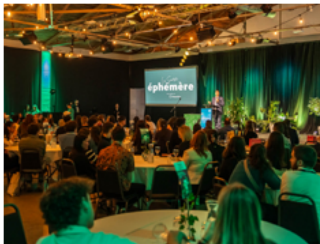
Gala event hosted by the Mauricie caisses.

Learn more about the Mauricie caisses' initiatives (in French only).