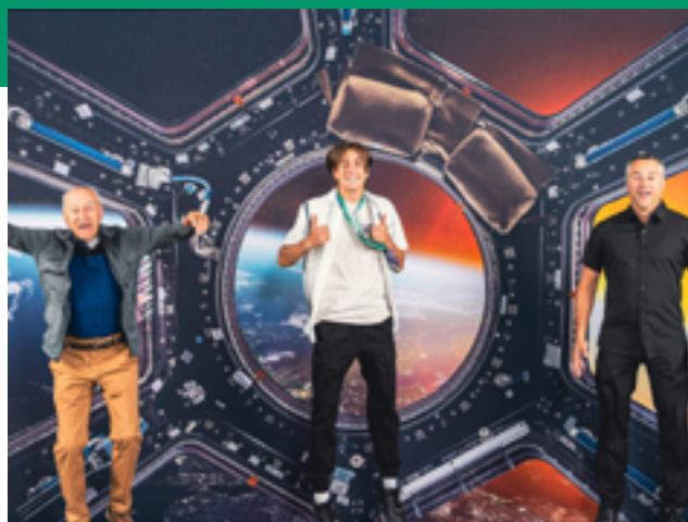
Guests having fun taking very "spatial" pictures!