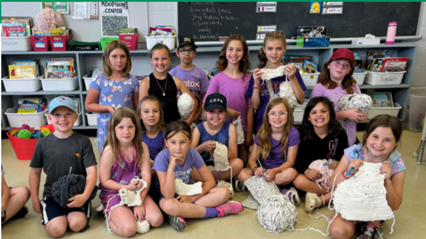
A group of students who took part in the Cobden District Public School project.